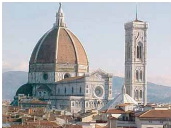
World-famous Duomo located in Florence, Italy

ACM, the Association for Computing Machinery, is a major force in advancing the skills and knowledge of Information Technology (IT) professionals and students throughout the world. ACM serves as an umbrella organization, offering its 80,000 members a resource for lifelong learning in the rapidly changing IT field. Please visit www.acm.org for more information.